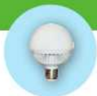
Table and pendant lamps