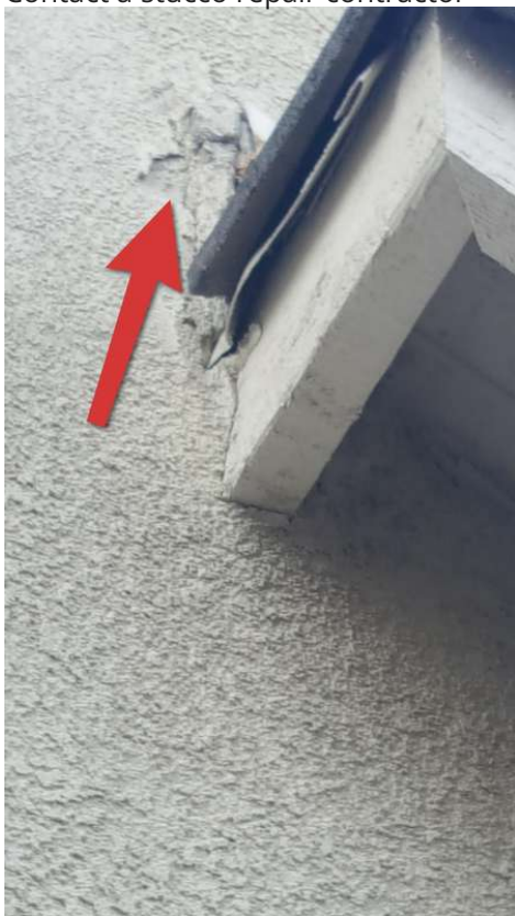
LEFT FRONT Garage

Some areas of the siding were damaged. Recommend repair. Recommendation Contact a stucco repair contractor