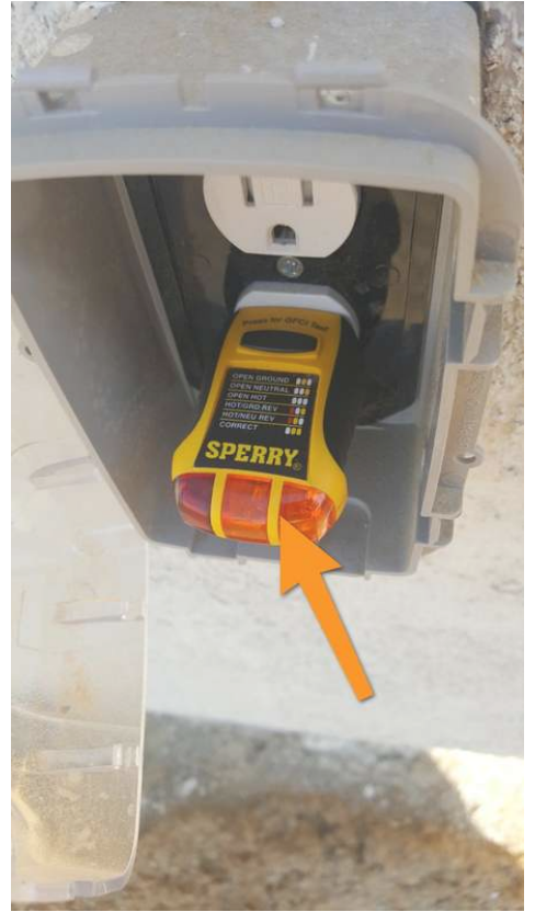
back of house

Recommendation Contact a qualified electrical contractor.