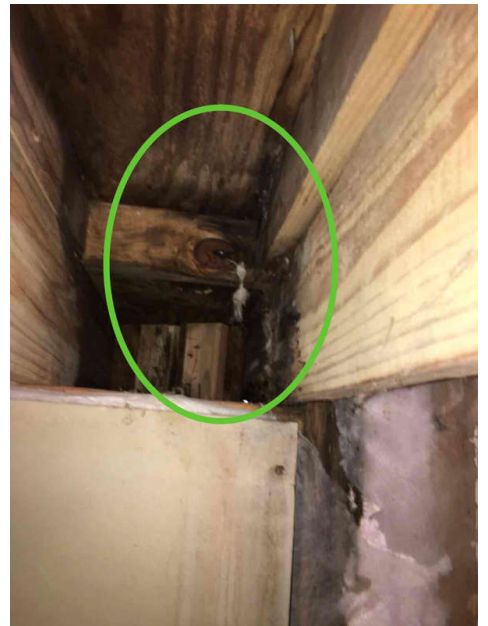
Floor joists showing deterioration