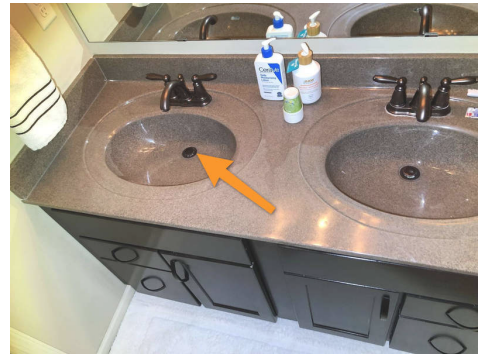
Slow Drain on left