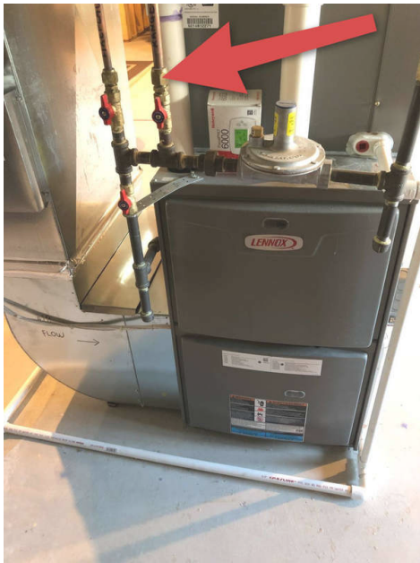
Gas leak area