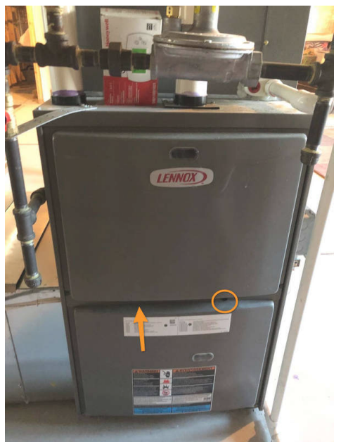
Left one missing, Right One OK